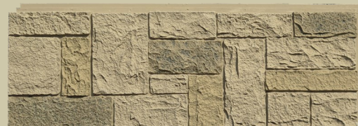
Castle Rock panel- Windsor Buff shown

NextStone™ can help maximize your bottom line. Visit our website at: www.nextstone.com for full product line, installation information and technical specifications.