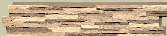
Stacked Stone panel- Kentucky Gray shown

Post Covers & Lighting Column Wraps Sandstone Inside Corners Ledgers & Ledger Corners Outside Corners Starter Strips Window Trim Mounting Blocks