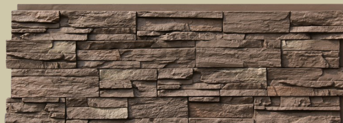
Country LedgeStone Panel—Himalayan Brown