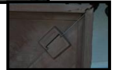
2 piece cap Top and Bottom