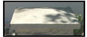
1 piece cap

The Column Wrap is a unique piece that can act as matching trim or stand alone, available