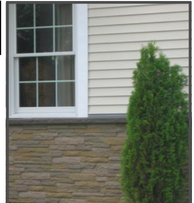
Ledgestone Western Taupe with Gray Ledger

When installing your corners, you have several options; Inside and Outside corners in the Ledgestone pattern (upper right), the Sandstone corner (lower left) or a mitered corner (lower right).