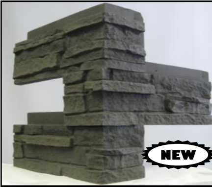
Drystack Flush Outside Corner featured in the December Newsletter

product line. Pictured here are the Random Rock and Drystack Flush Outside Corners that when installed will appear more realistic by wrapping the corner and continuing a few inches down the wall. The Random Rock Corners are IN STOCK in all colors and the Drystack Flush Outside corner is IN STOCK in Carolina Cocoa, Western Taupe and Kentucky Gray; all other colors are available as special order 6 - 8 weeks out. Both of these come in a box quantity of 4,